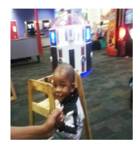
Children who die feel no pleasure or pain in the place where they wait till they see us again.